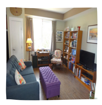
1BR APARTMENT AVAILABLE MAY 1st - 3804 32nd Avenue, Vernon BC